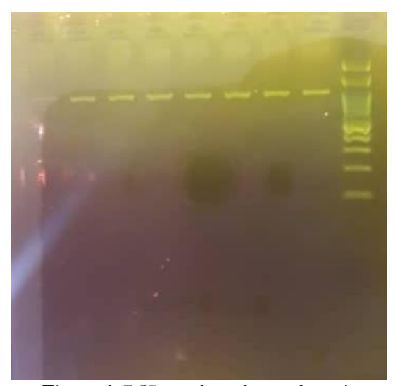
Figure 1. PCR product electrophoresis image examples

PCR amplification was carried out at 95°C for 5 min, followed by denaturation at 95°C for 1min, annealing at 60°C 1 min and extension at 72°C for 1 min (32 cycles) followed by a final extension for 5 min. The PCR products were electrophoresed on a 1.5% Agarose gel (Figure 1). PCR products were purified with ExoSAP followed by bidirectional sequencing with the BigDye Terminator v1.1 Cycle Sequencing kit on an ABI3130XL Genetic Analyzer.